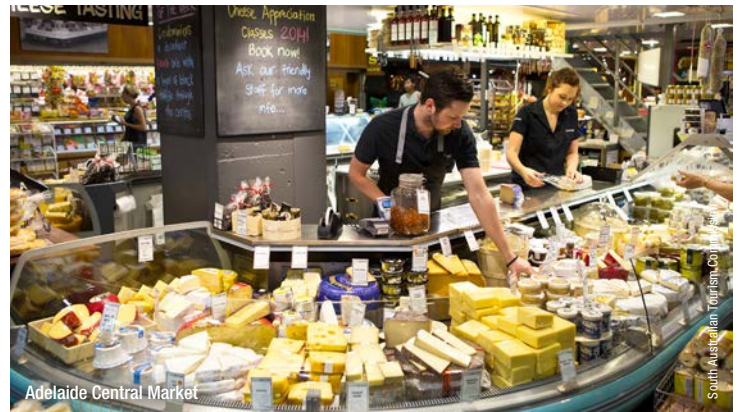
Adelaide Central Market