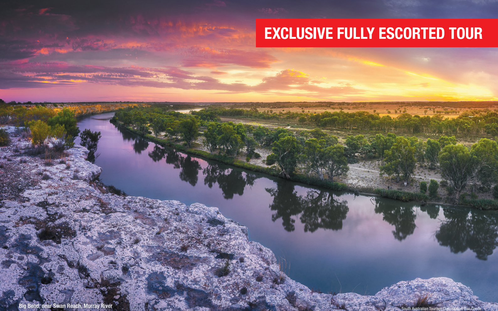
Big Bend, near Swan Reach, Murray River